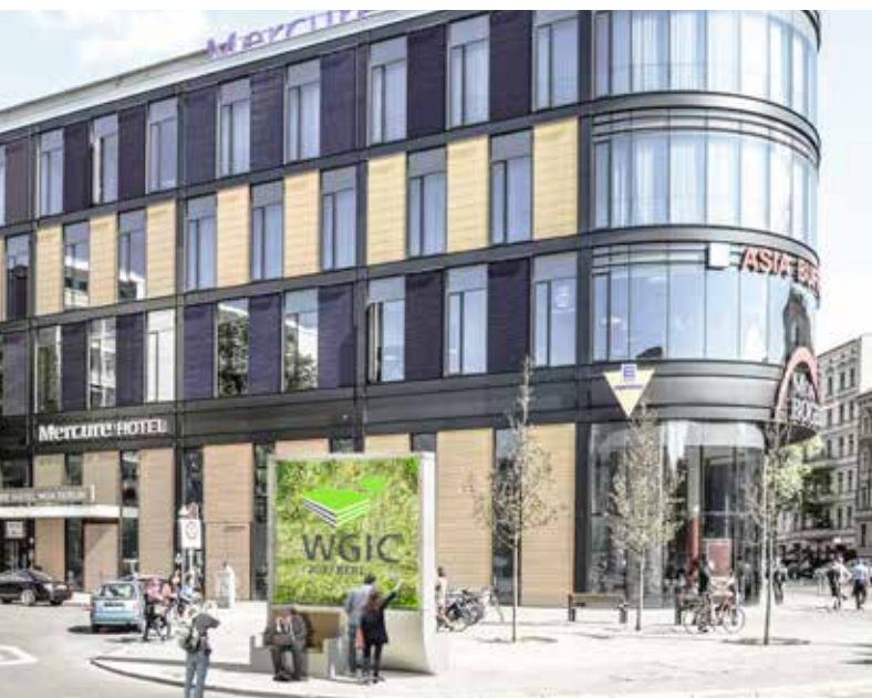
Mercure Hotel MOA, Berlin