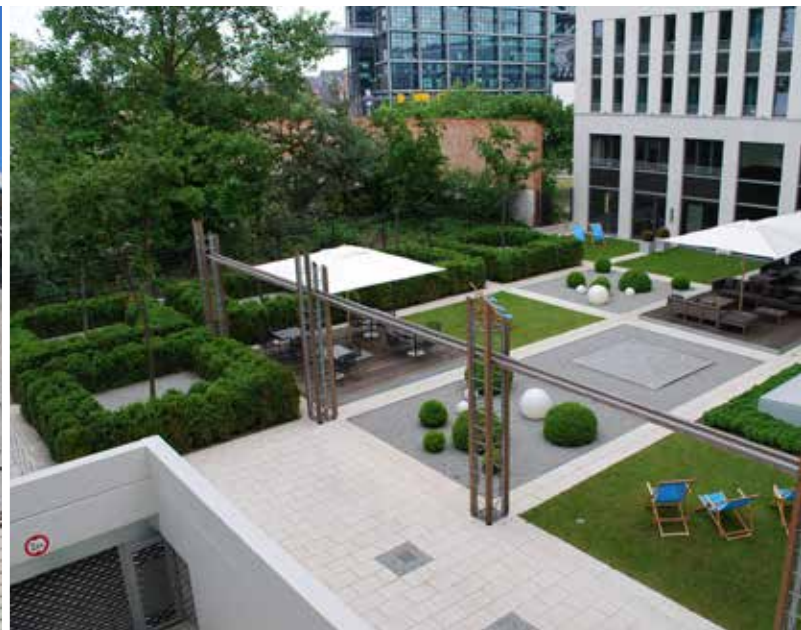
Motel One, Berlin