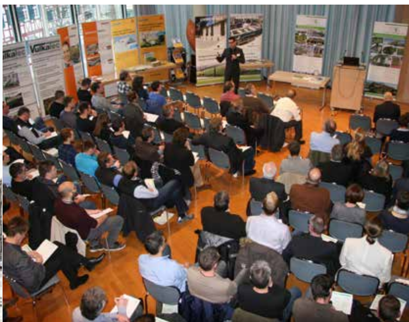
The FBB has a tradition of annual conference of many years