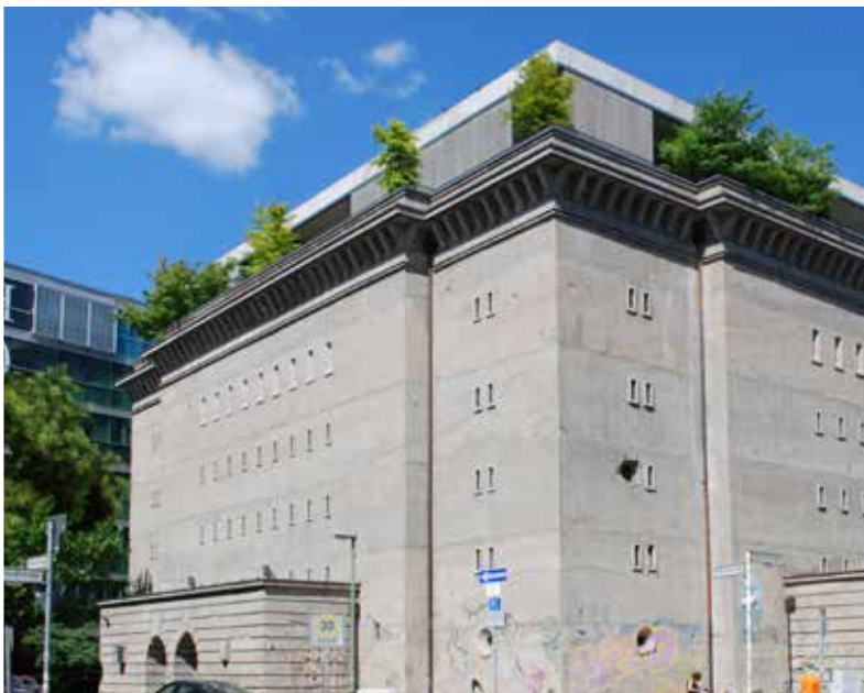
Bunker Boros, Berlin