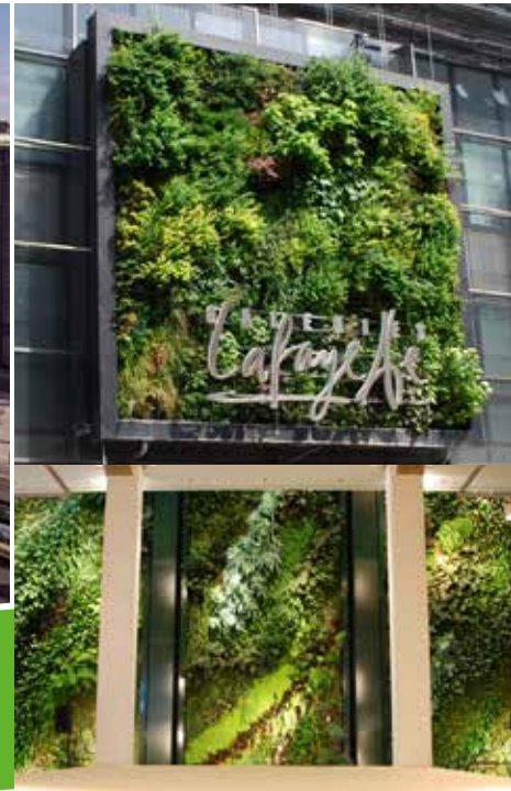
Galleries Lafayette, Berlin (top) Kulturkaufhaus Dussmann, Berlin (bottom)