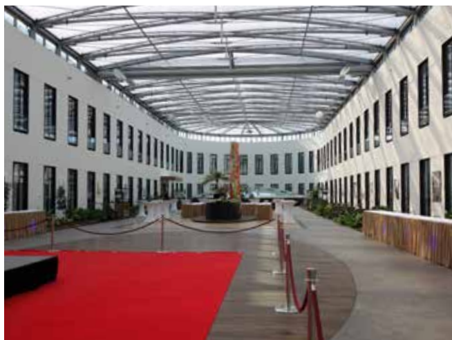
Atrium Mercure Hotel MOA, Berlin

*In the neighborhood are various further hotels of different categories available.